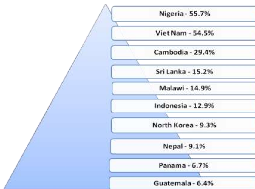
Figure 3 –Percentage of lost forest areas among the most affected countries

According to the revised deforestation figures of ten most affected countries from the Food and Agricultural Organization of the United Nations (FAO), Nigeria has lost an average of 55.7 % of its forest areas, again ranking highest among countries whose forest areas have been lost. The pyramid chart below gives the details (see Figure 3).